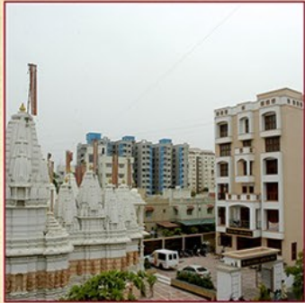
Prerna Tirth Jain Derasar & Upashray