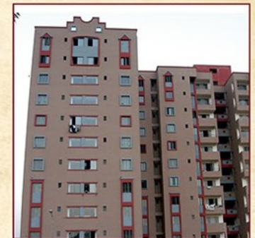
Prerna Viraj 2