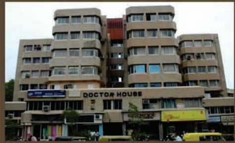
Doctor House - C .G Road