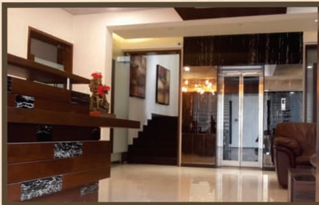
Prerna Infrabuild Limited - Prahladh Nagar