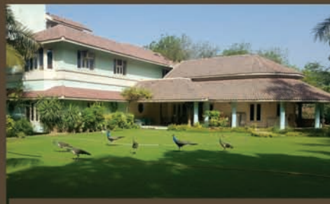
Prerna Farm - Prahladh Nagar