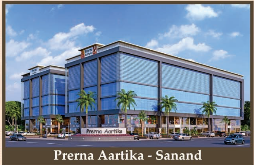
Prerna Aartika - Sanand

Serving the society has been our motto, our company was the first to start Private Corporate Hospital in Gujarat named Prerna Hospital at Doctor House that served people for 15 years.