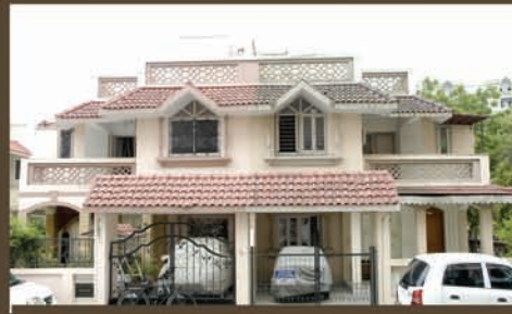
Prerna Tirth 1 - Satellite