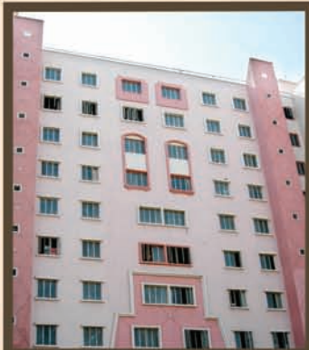
Prerna Viraj 1 - Satellite