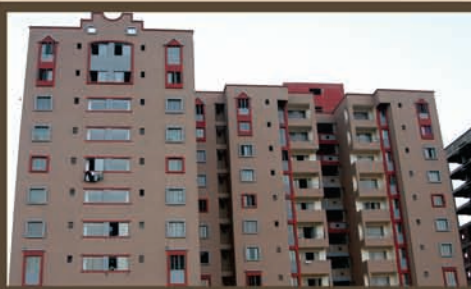
Prerna Viraj 2 - Satellite