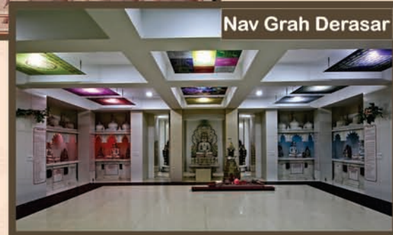
PRERNA DHAM AT SATELLITE