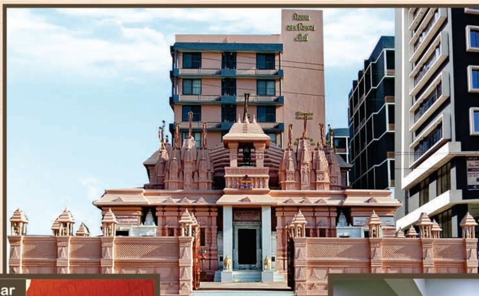
24 Tirthankar Derasar