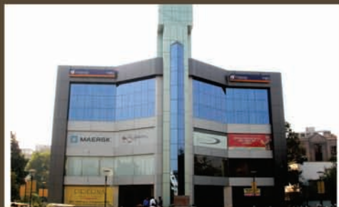
Prerna Arcade - C .G Road