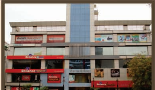
Prerna Arbour - C .G Road