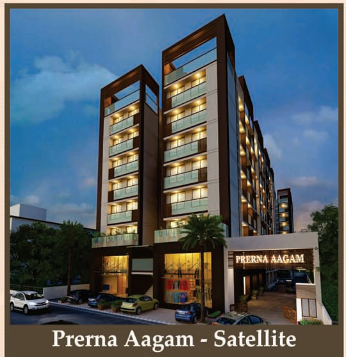
Prerna Aagam - Satellite