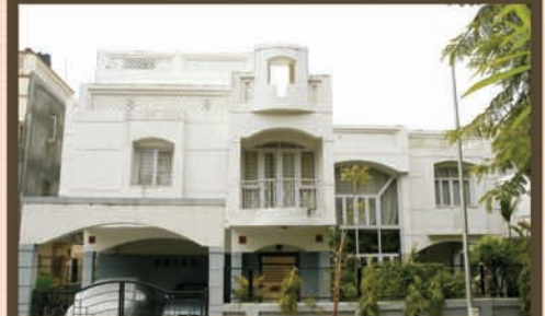
Prerna Tirth 2 - Satellite