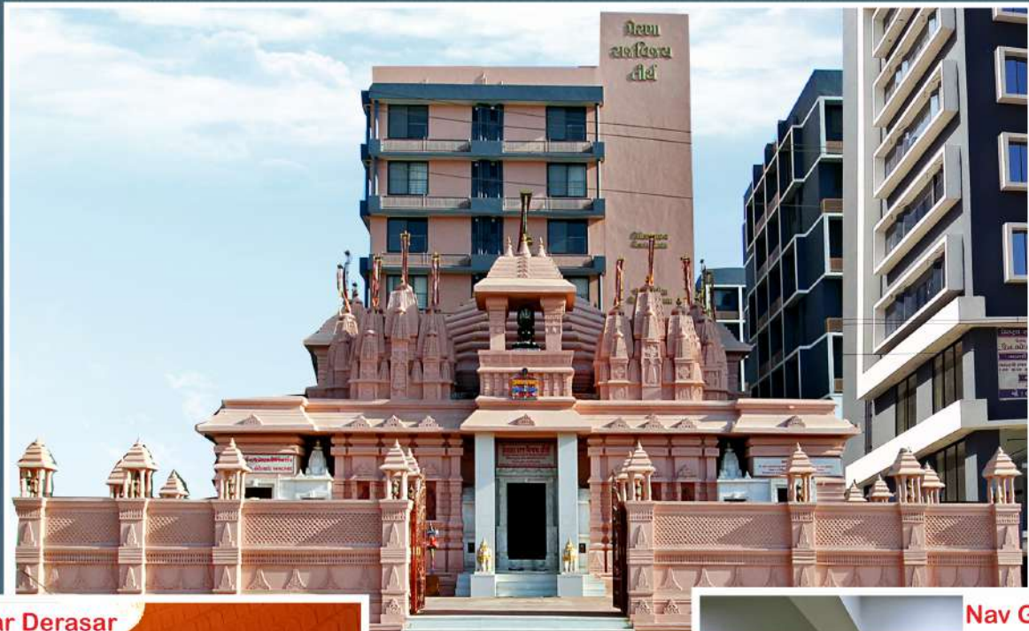
24 Tirthankar Derasar